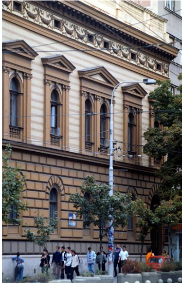
Belgrade, Terazije 41, ECPD Headquarters